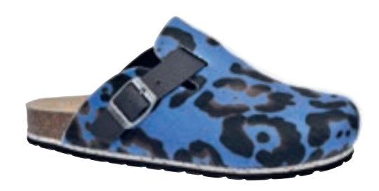
Vermont // 480070 Recycled Textile // 72 Blue // Size 36-42