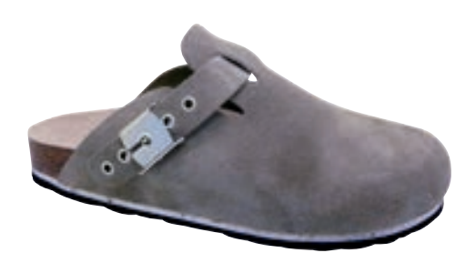
Mykonos Suede // 480026 Suede // 20 Grey // Size 36-42