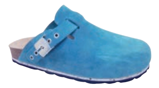
Mykonos Suede // 480026 Suede // 8 Turquoise // Size 36-42

Minimalistic sandal or mule style in turquoise or grey cow suede from European tannery. Suede covered ergonomic shaped footbed with carbon foam comforting and keeping your feet dry.