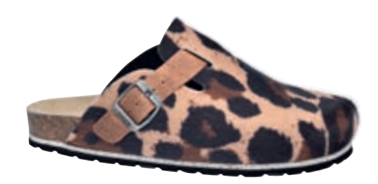
Vermont // 480070 Recycled Textile // 14 Nature // Size 36-42

Stylish leopard-print slippers in recycle fabric with adjustable strap in leather. Top insole is made of a mix of rubber and recycle cork to make it soft and flexible. Soft foam is added to the top layer of the insole to add extra comfort. Outsole is a combination of wood waste from our wooden sole production combined with EVA.