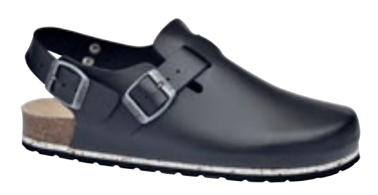
Malta Closed // 480040 Recycled rPET // 2 Black // Size 36-46