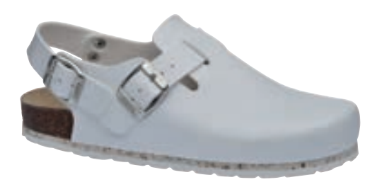
Malta Closed // 480040 Recycled rPET // 1 White // Size 36-46

Orthopedic approved sandals designed and certified to maintain professional safety standards without sacrificing comfort and support. Recycling sandals are made in rPET with different upper designs and leather insole. Top insole is made of a mix of rubber and recycle cork to make it soft and flexible. Soft foam is added to the top layer of the insole to add extra comfort. Outsole is a combination of wood waste from our wooden sole production combined with EVA.